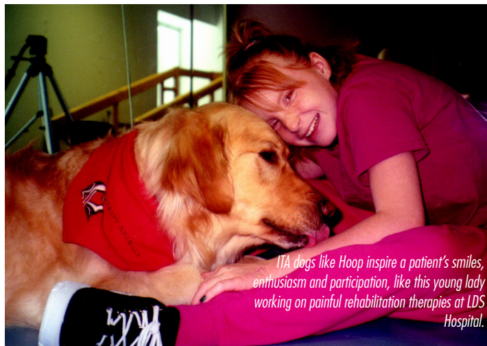
ITA dogs like Hoop inspire a patient's smiles, enthusiasm and participation, like this young lady working on painful rehabilitation therapies at LDS Hospital.

Aspen Pointe / Bozeman Bear Creek Respite / Bozeman Big Sky Ski Patrol / Bozeman Big Sky Youth Center / Bozeman Birchwood Retirement / Bozeman Bozeman Deaconess Hospital (cancer treatment center, dialysis unit and surgical waiting room) Bozeman Public Library (R.E.A.D.) / Bozeman Churchill Retirement Home / Bozeman Eagle Mount Camp / Bozeman Emily Dickinson Elementary (R.E.A.D.) / Bozeman Epicenter / Bozeman Frontier Assisted Living / Bozeman Gallatin Rest Home / Bozeman Great Northern Physical Therapy Hawthorne Elementary School (R.E.A.D.) High Country Care / Bozeman Highgate / Bozeman (retirement home) Morningstar Elementary (R.E.A.D.) / Bozeman Mountain View Care Center / Bozeman New Horizons / Livingston Parkhaven Retirement / Bozeman Prestige Assisted Living / Bozeman REACH Homes for Developmentally Disabled Adults / Bozeman Springmeadows Assisted Living / Bozeman Whittier Elementary (R.E.A.D.) / Bozeman