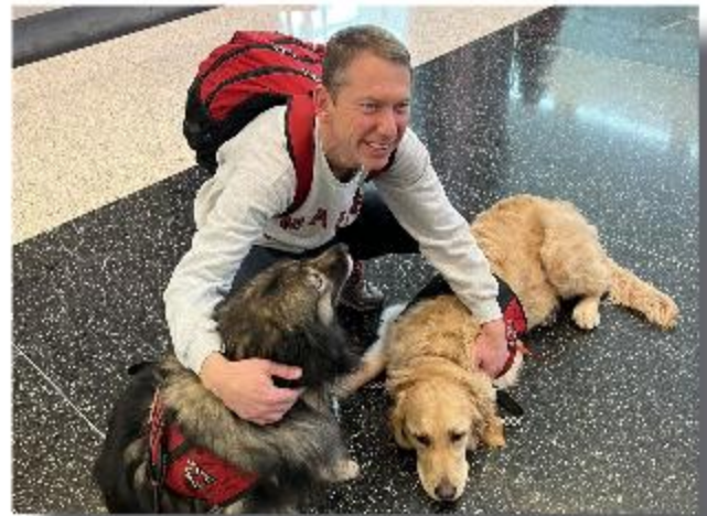
The stresses of traveling are more intense than ever, and our dogs bring a lot of joy and stress relief at the airports where they visit.