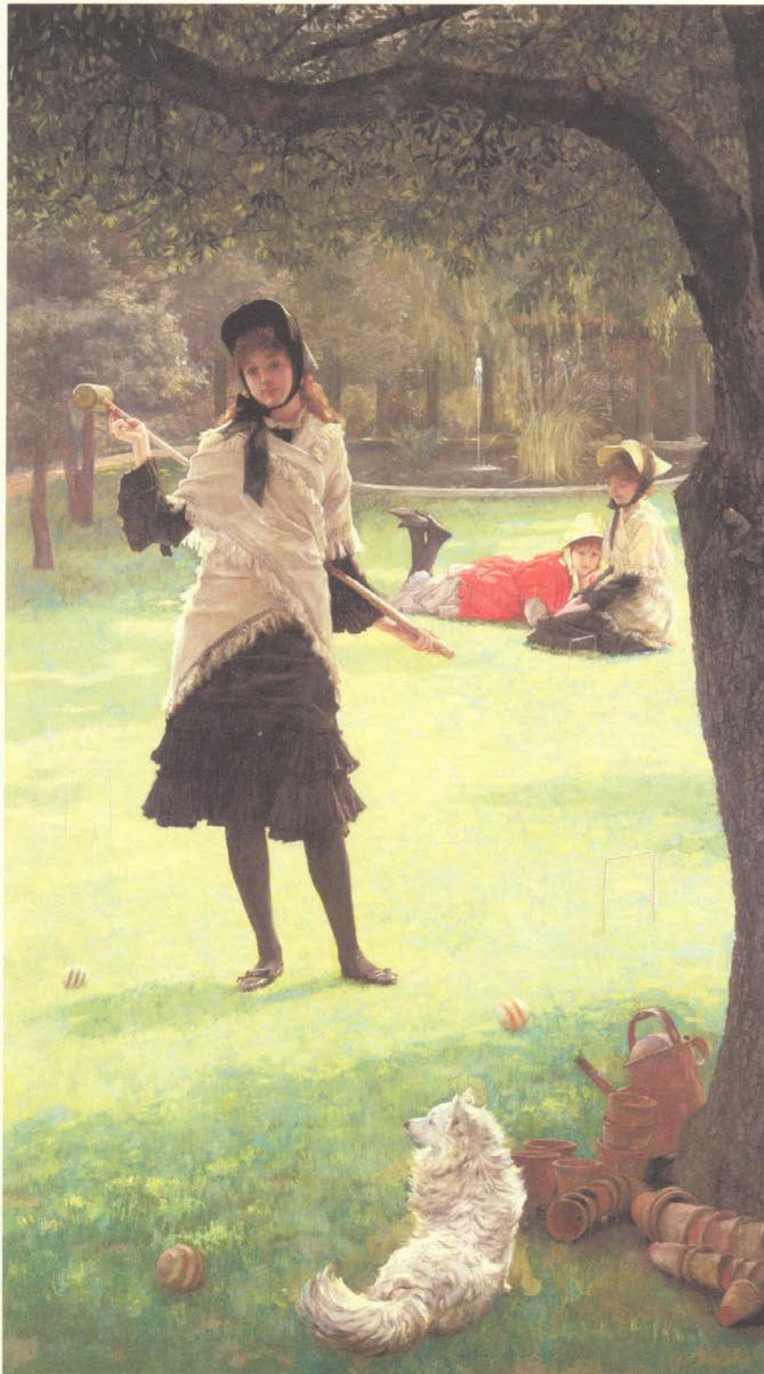
Croquet - James Tissot - c. 1878